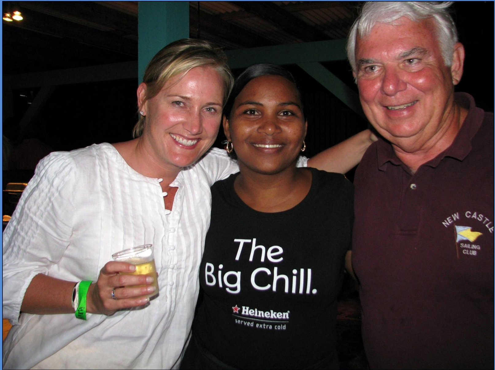
Our waitress for the evening