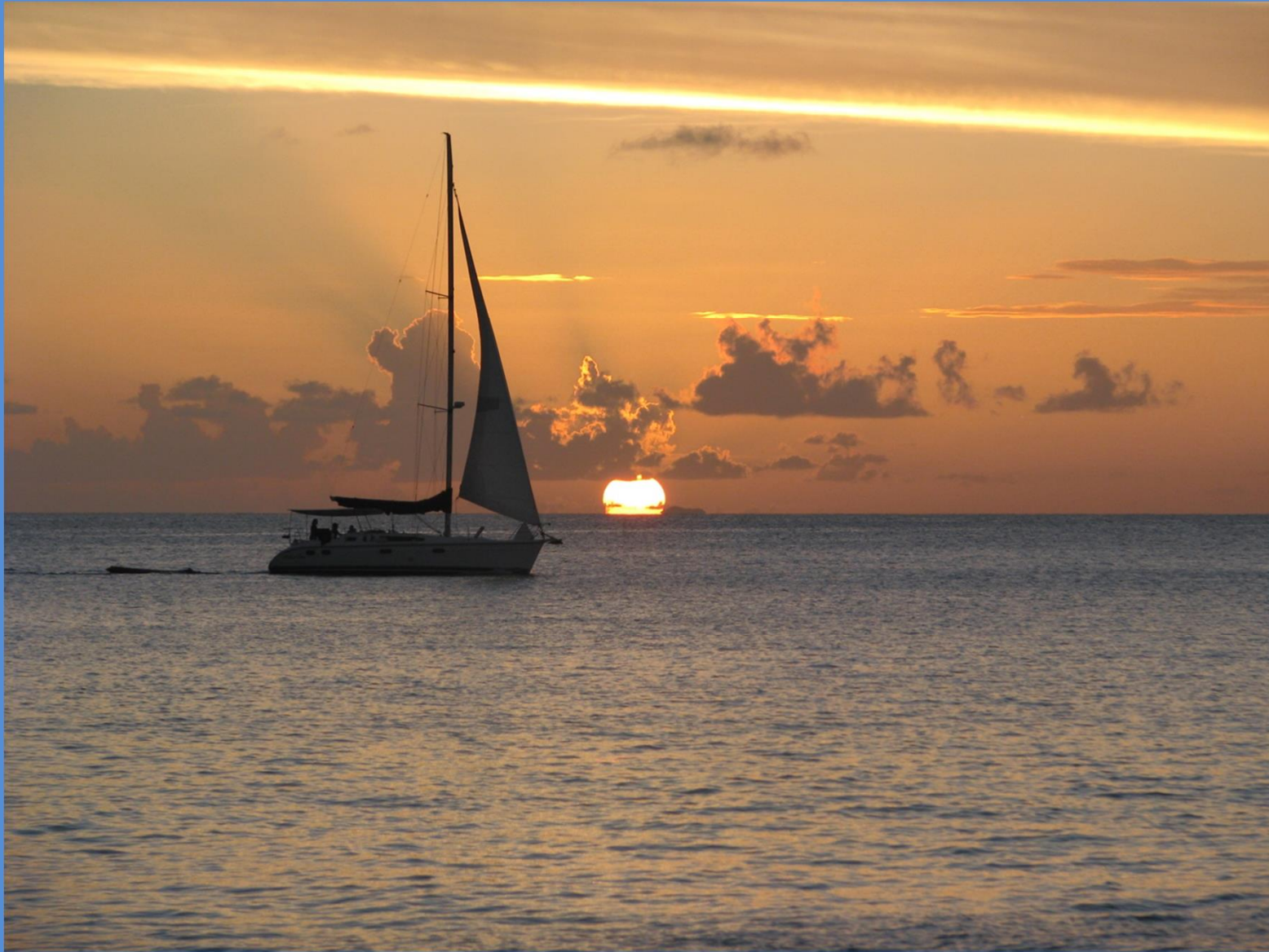
A boat sails into the harbor as the sun sets