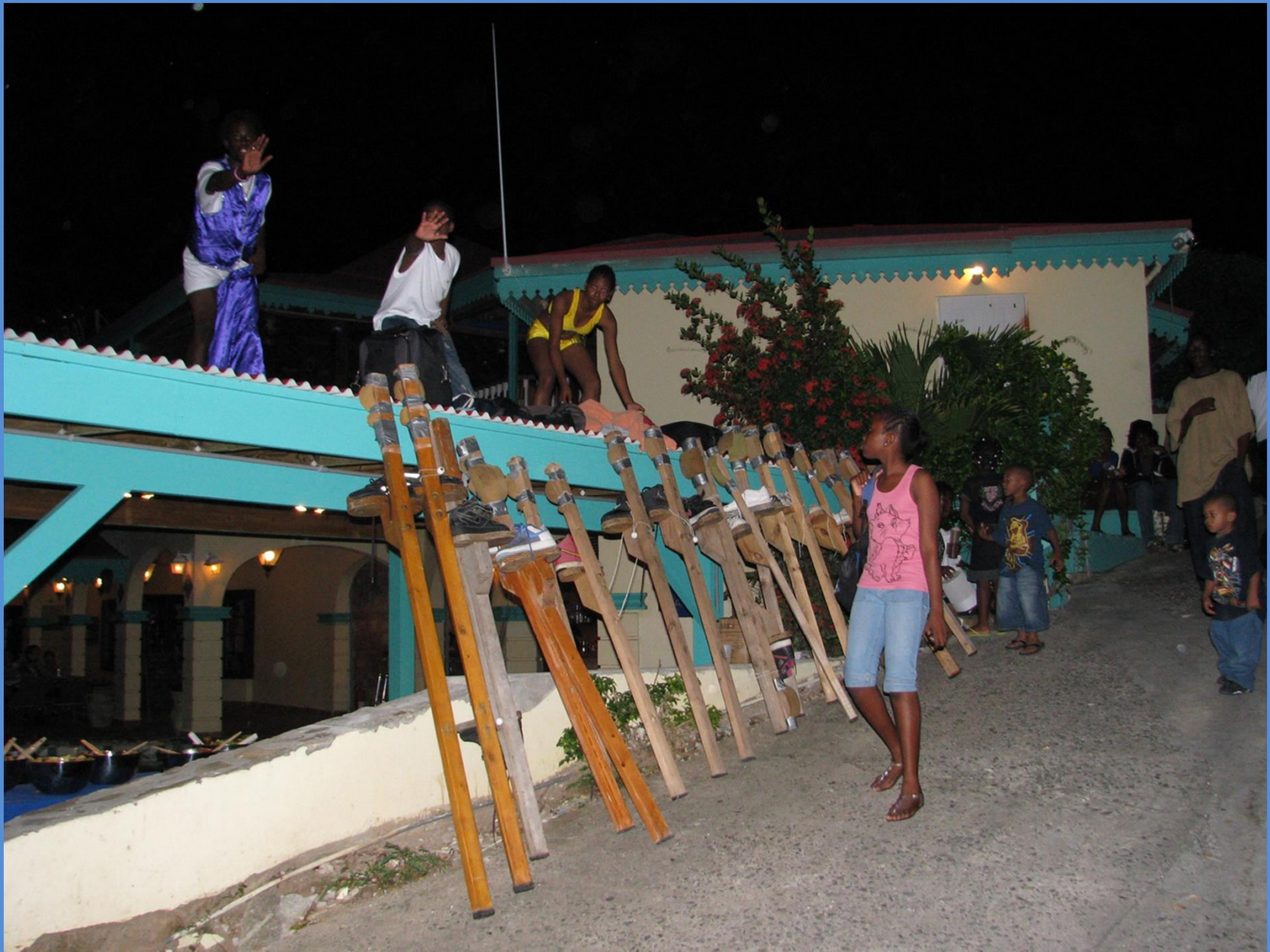
The Jumbies getting ready for the show. I learned later that I was not suppose to take pictures of their preparation