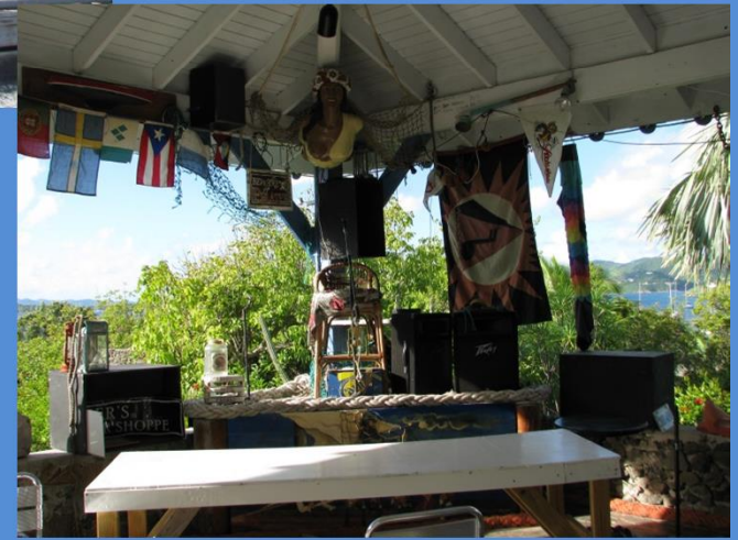
Scenes from Biars Creek in Gorda Sound