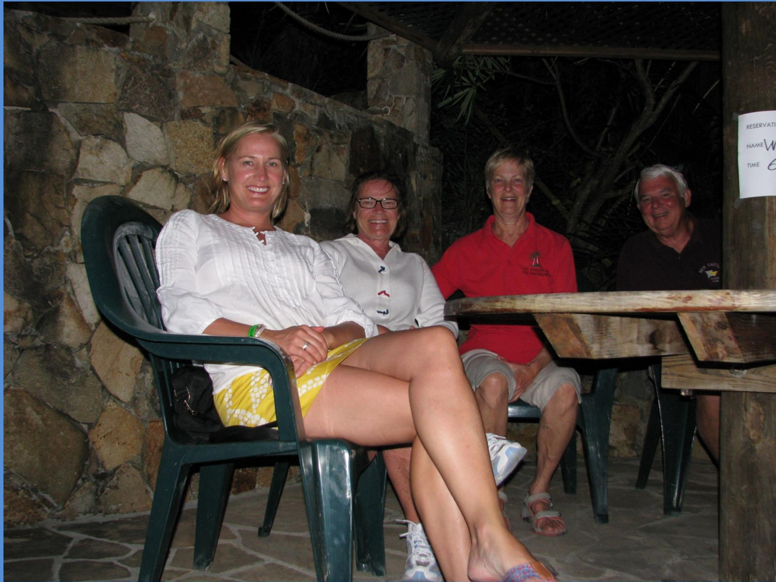
We had a prime balcony table for the Jumbie show