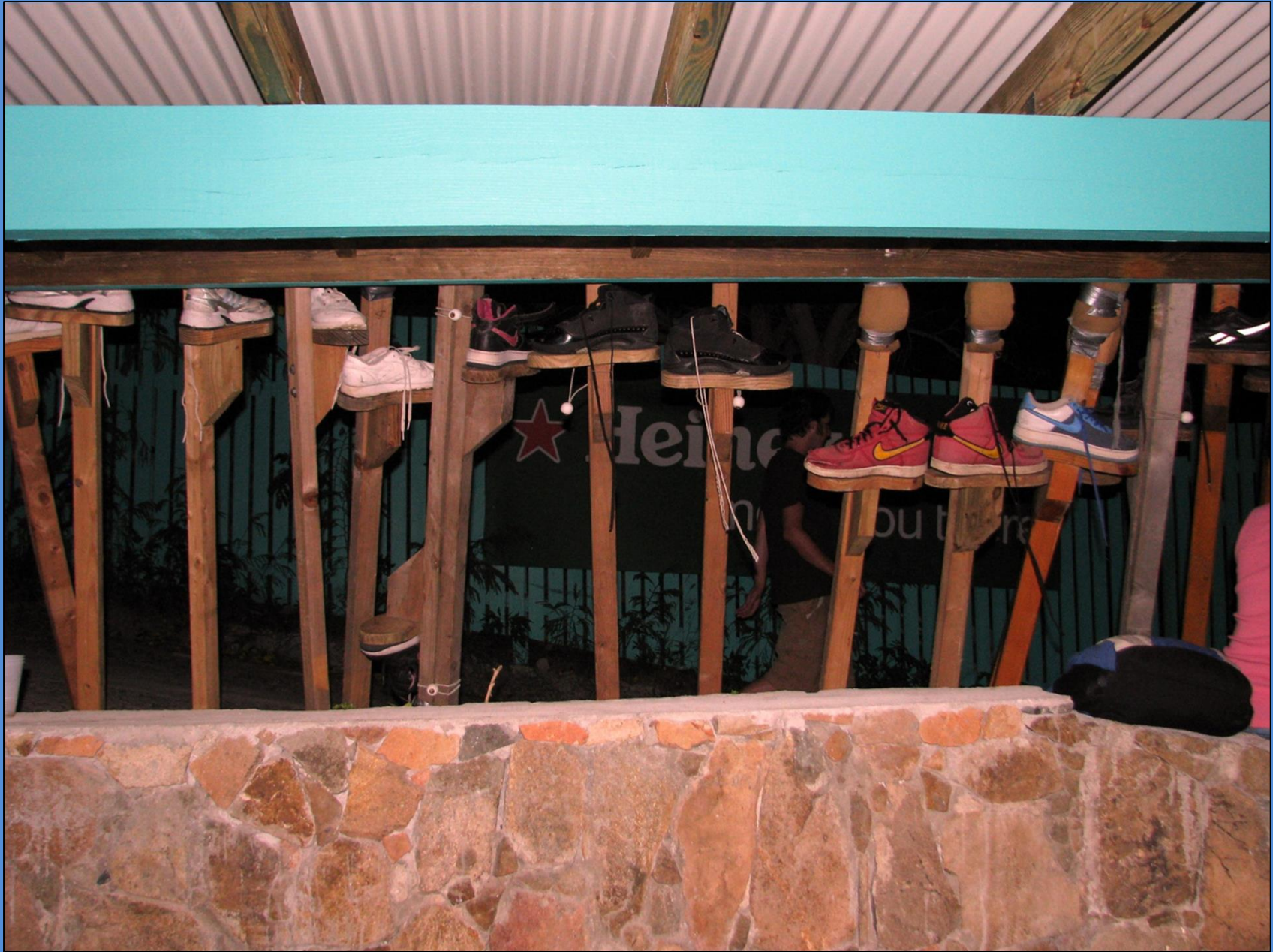
The shoes are attached to the stilts