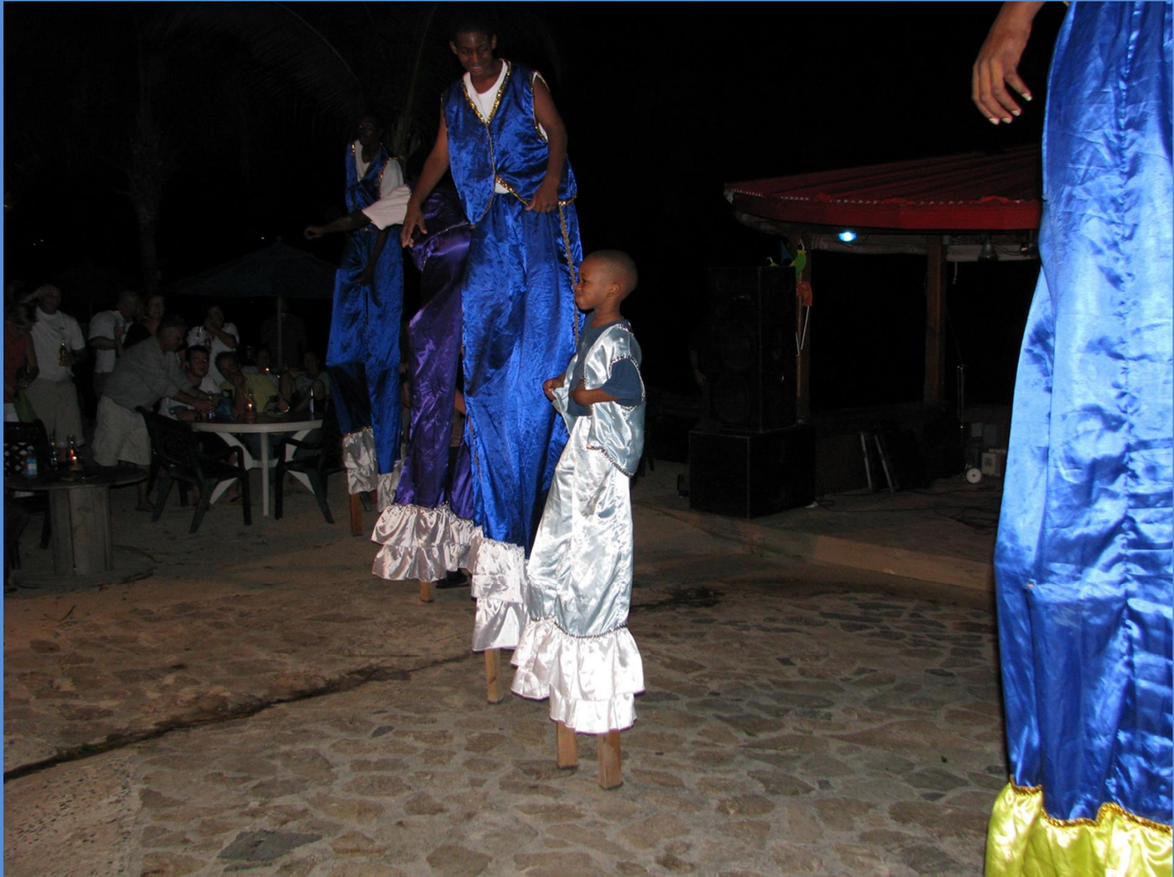
He looked to be about eight years old