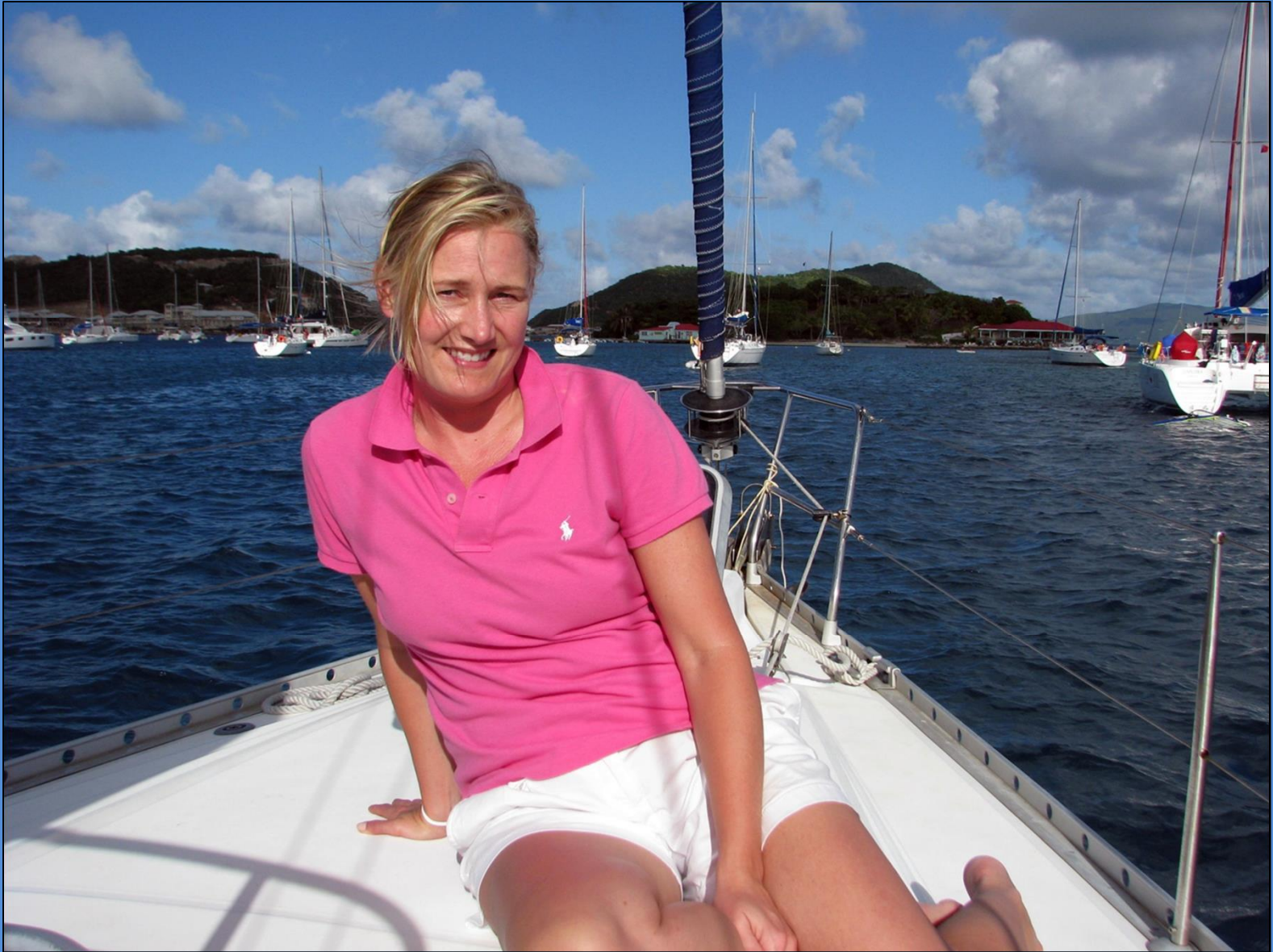
Sailing into Gorda Sound