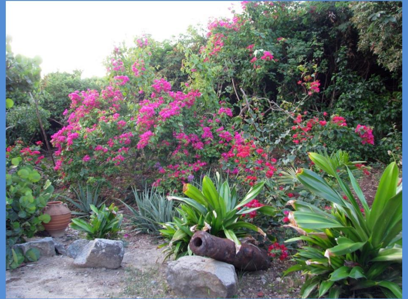
Leverick Bay Resort