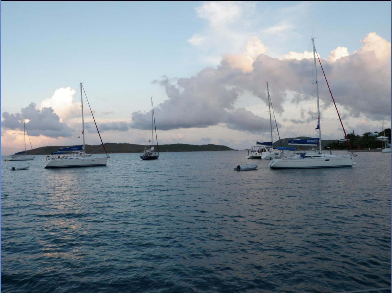
The mooring field at Leverick Bay in Gorda Sound