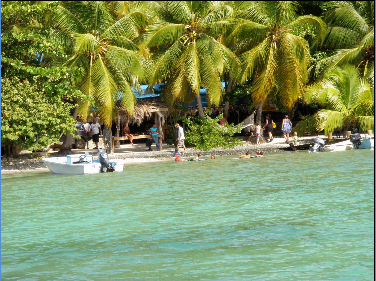
The beach and restaurant on Ginger Island