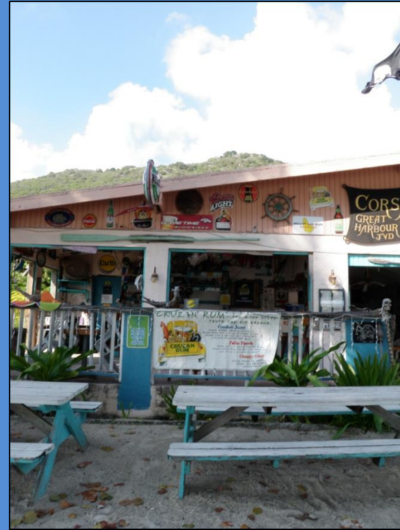
We enjoyed a lunch at Foxy's on Jost Van Dyke