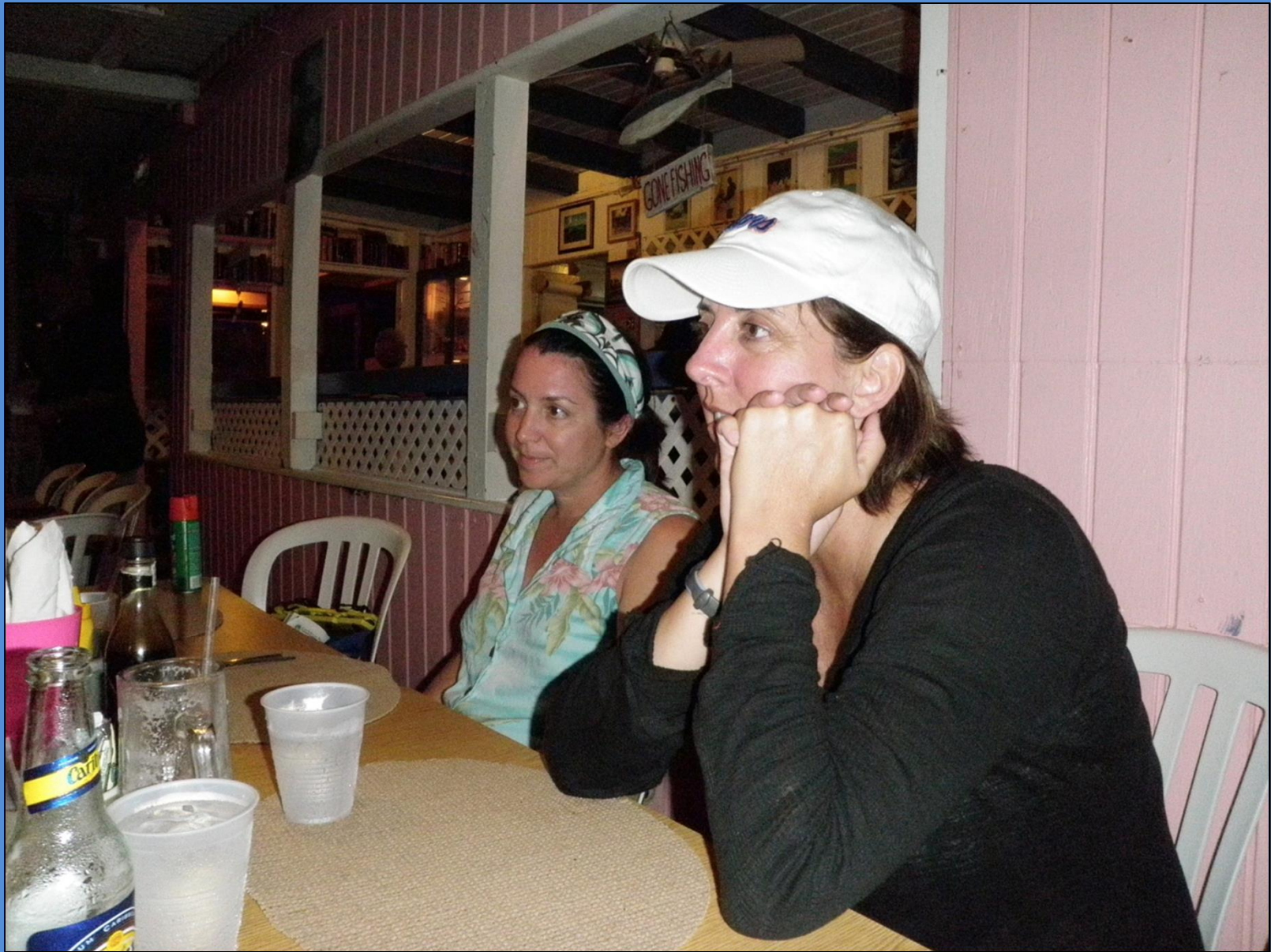
We enjoy dinner at de Loose Mongoose restaurant