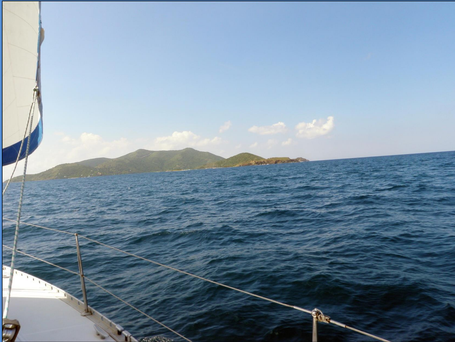
Sailing between islands in the Sir Francis Drake Channel