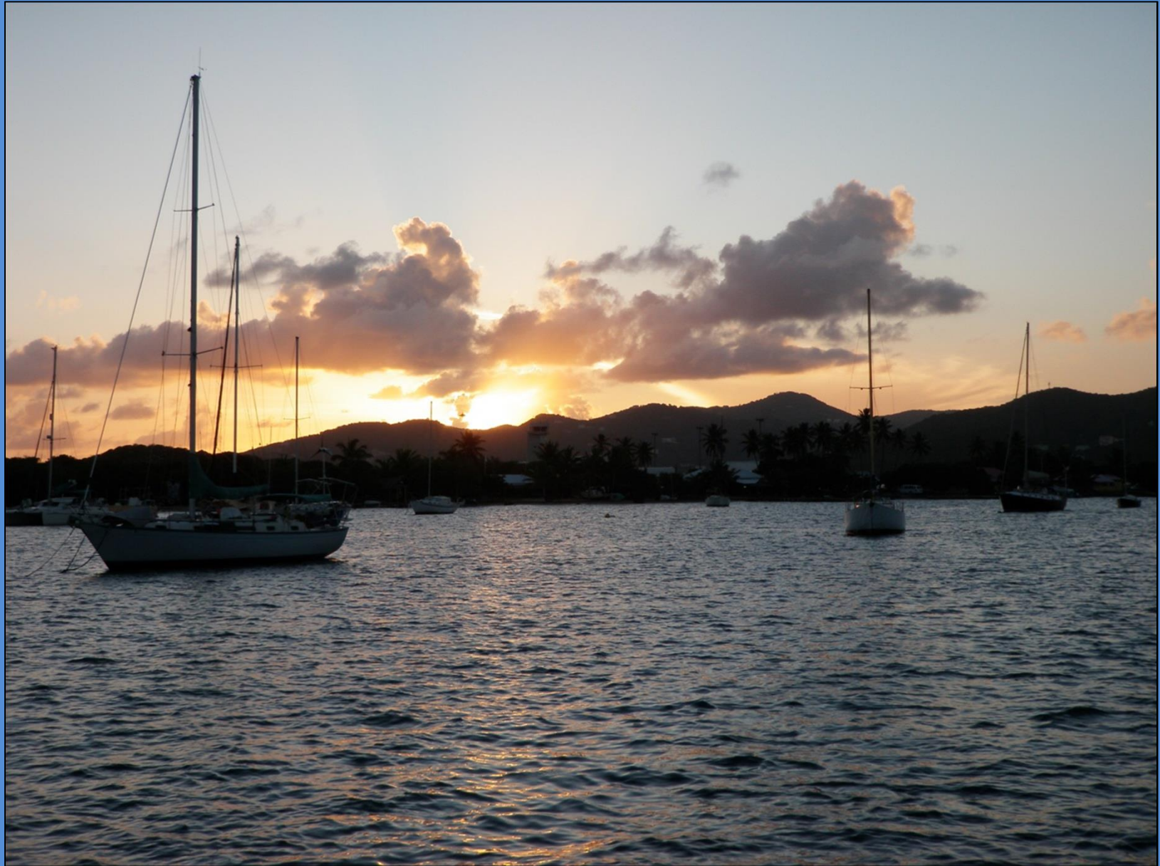
The anchorage at Trellis Bay that we used when meeting folks at the airport that was about a half mile walk from the beach